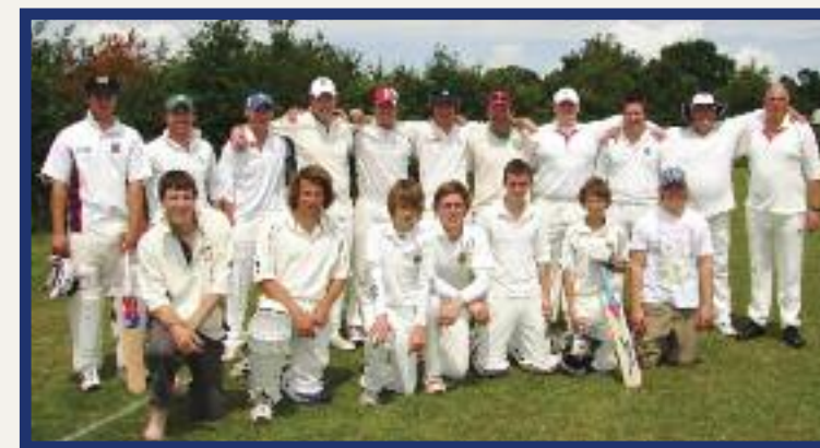
The Bethanians' Society and the 1st XI cricket teams, 28 June 2009.